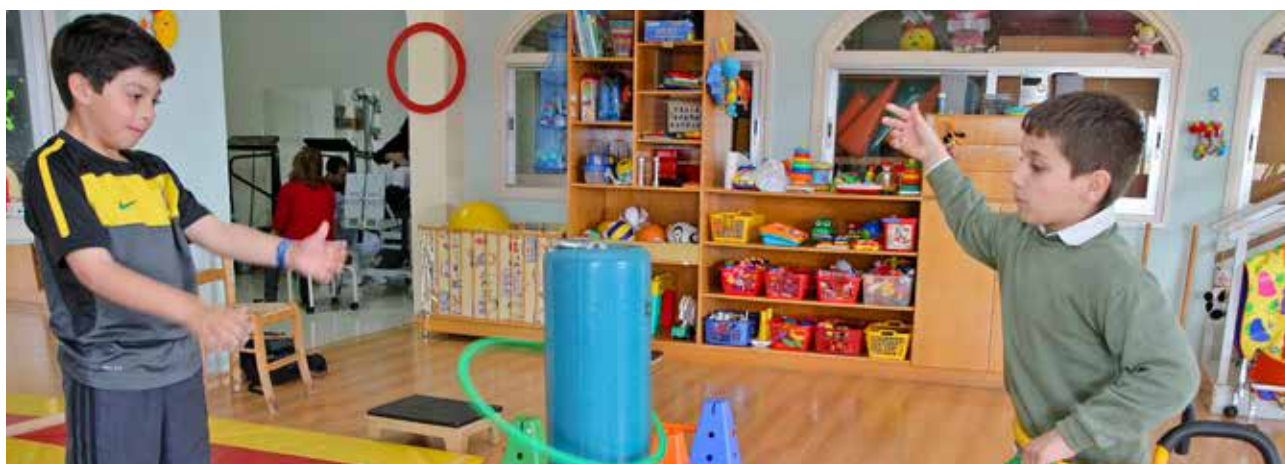
The Centre serves more than 100 children up to 22 years old, with severe physical and multiple disabilities, such as cerebral palsy, muscular dystrophy and other physical and developmental problems.

The Centre is considered to be unique due to its multi therapy programmes by experienced staff and covers a wide age spectrum. The Centre serves more than 100 children up to 22 years old, with severe physical and multiple disabilities, such as cerebral palsy, muscular dystrophy and other physical and developmental problems. In addition to medical and nursing care, the Centre offers physiotherapy, hydrotherapy, speech therapy, occupational therapy, sensory integration therapy, horse riding; it also provides assessments for technical mobility aid for the children's comfort and post operative physiotherapy home visits. Close attention is paid to creating a family atmosphere, the children's entertainment, facilitating their social integration and generally making the best possible effort to give them a better quality of life. The services offered by the Centre are constantly upgraded. A specialist Pediatrician supervises the general healthcare, cooperating closely with the Limassol General Hospital and foreign specialists. Dedicated therapy personnel and a fully comprehensive set of equipment provide healthcare and therapeutic treatment of the highest standard.